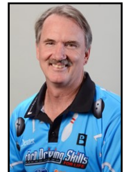
Walter Ray Williams Jr. - winner of 100 combined titles.

MISSION STATEMENT: To provide bowling fans important bowling news, thoughtful analysis, and keen observations about professional and regional bowling tournaments.